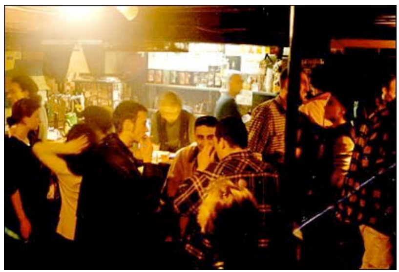
Lyons, France: Drinks for all my friends!!! Well actually we don't know ANY of these people and this is a stolen photo but you know what the hell we mean.

When I'm awaken by a youngish fellow who excitedly and in very good English talks about just about everything, I find myself suddenly swept away by his enthusiasm, so much so that I ask him..