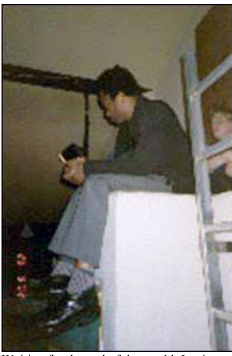
Waiting for the end of the world. In pimp socks no less.

that we were gobbling acid and drinking wine and having a fine old time in a city that someone had prophetically dubbed The City of Lights. Hot damn.