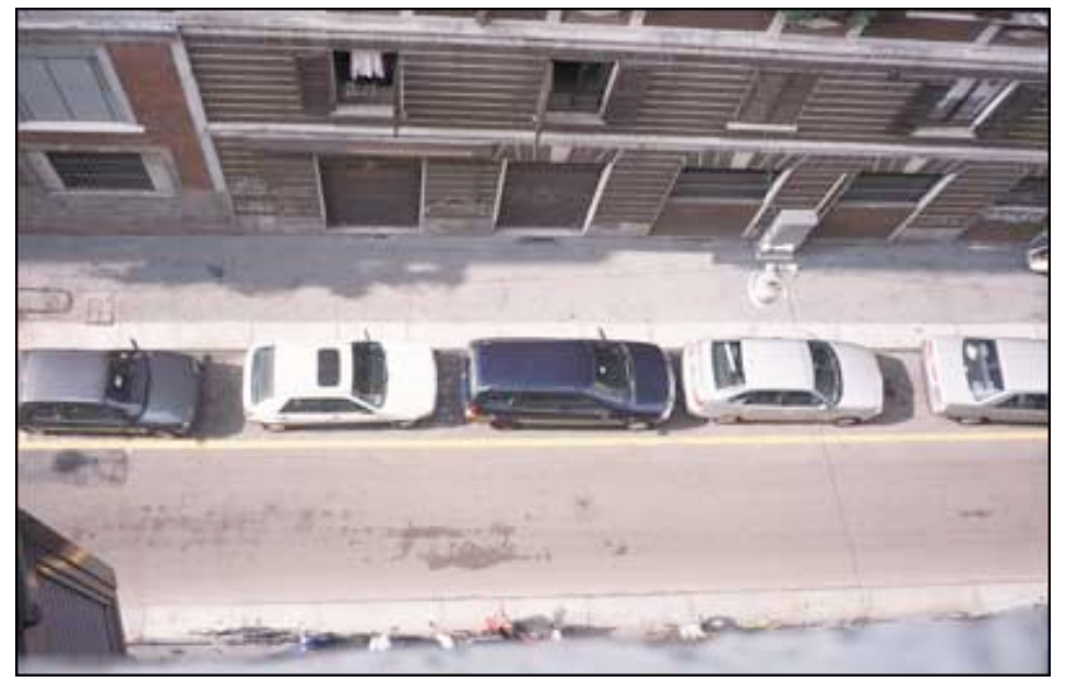
Jerking Off, Scrambling Eggs, What's the Diff? The Onanist's Apartment minus The Onanist

Staring across the street into apartments below I can see the outline of a guy who I imagine is cooking eggs. His hands are furiously scrambling them and it seems he's watching TV when he's doing it and this I buy until it dawns on me that he's in his bedroom and not the kitchen and he's not cooking eggs but jerking off.