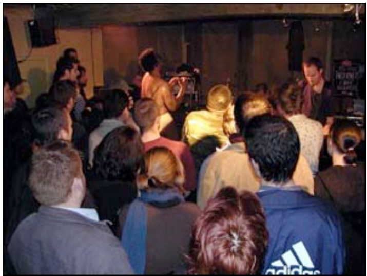
In search of Miles Davis: Where the fuck did the audience go? Oh. Sneak up behind me will you?!?