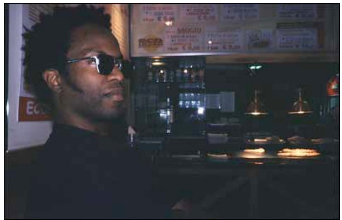
Omigod, It IS Lenny Kravitz. Wave... Hi!!!!