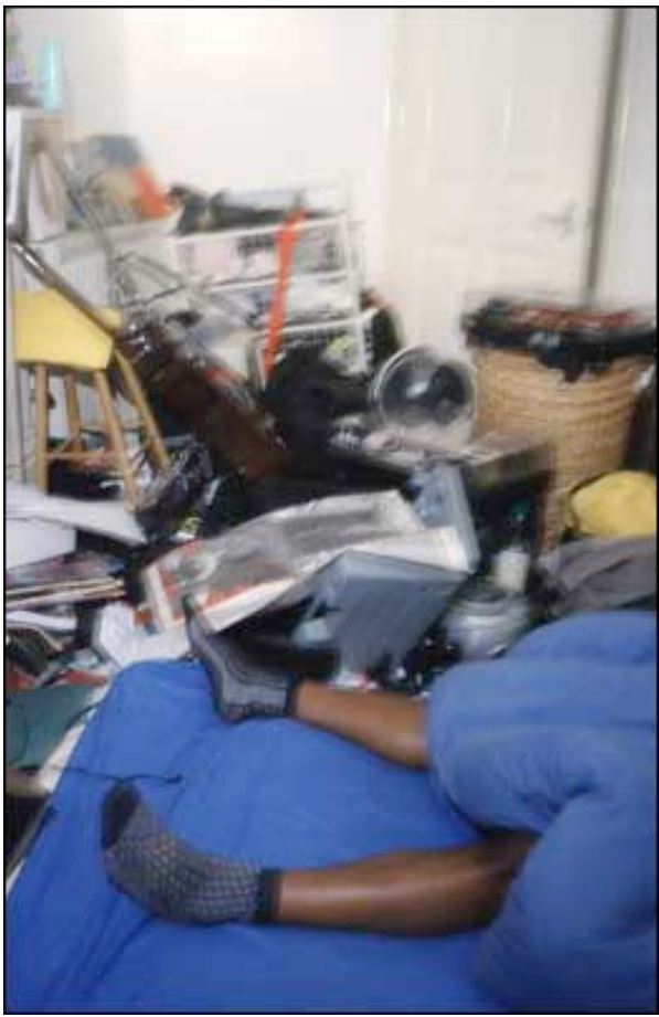
London The Morning After, the Night Before