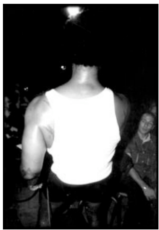
Hermes Trimegisthus: When in fucking Rome