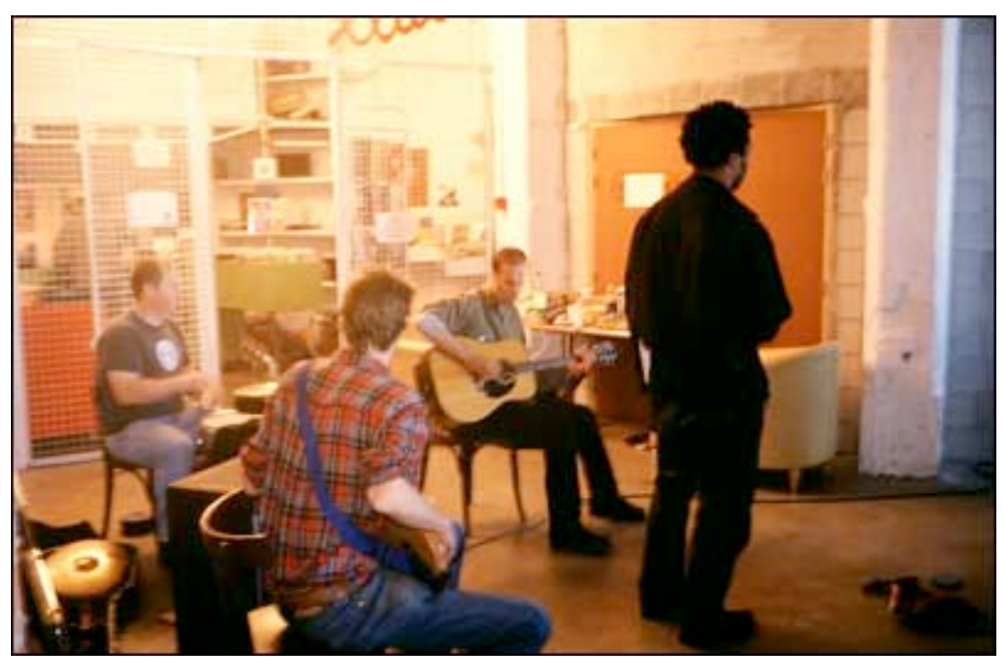
Instore appearance in Nantes. Note the wonderfully engaged shoppers in the background as they search for the new Ya Lo Tengo record.