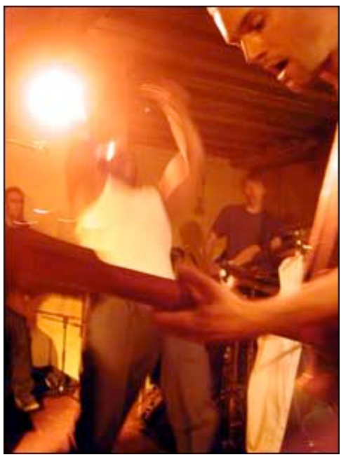
Niko stabbing Eugene in the groin. Repeatedly.